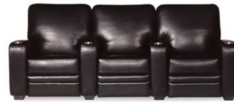
Themes furniture to create experiences