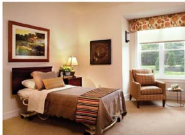
42" wide sleep surface