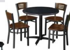
Flexible Seating Options