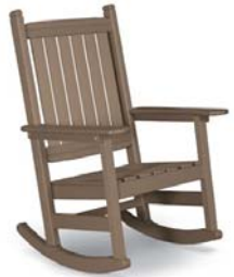
Functional Furniture for your Care Models, Philosophy and Climate