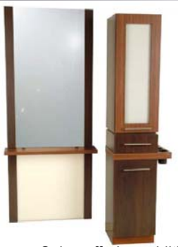
Salon offering additional service in an upscale environment