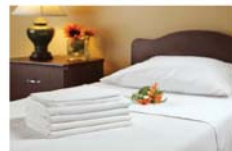
Soft, comfortable sheets