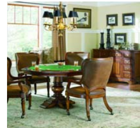
Multi-Function Furniture Pieces