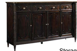
Storage Reflect the Experience