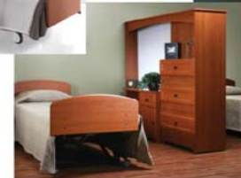
Casgood systems that conceal equipment and/or enhance resident privacy