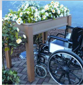
Accessible Outdoor Activities