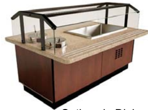
Options in Dining Spaces or Room