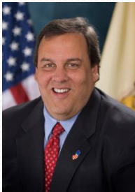
Chris Christie Governor