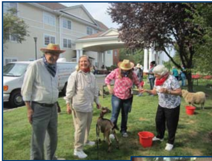
Left: Brandywine Senior Living at Pennington celebrated with residents, staff, family, and - yes - farm animals(!) during National Assisted Living Week.