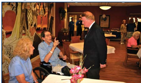
Representative Leonard Lance (R-NJ 7) visited with residents at Bridgeway Care & Rehab at Hillsborough.